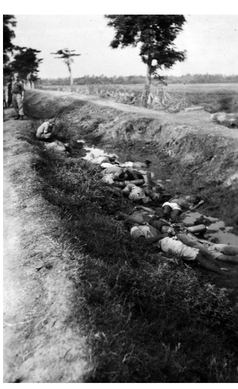
Figures 1.1 and 1.2. Photographs of an execution of Indonesians (presumably near Gedong Tataan, Sumatra) found in July 2012.

case signals a willingness by claimants and by the (civil) courts to puncture the 65-year-old official Dutch strategy to avoid legal treatment of these issues. When it decided to lift the statute of limitations on war crimes in 1971, the Dutch parliament even explicitly restricted the non-applicability of statutory limitations to enemy crimes, thus allowing Dutch crimes in Indonesia to become prescribed. Finally, family members of Indonesian victims are now active and visible in the Dutch sphere, as the recent court cases also demonstrate. They benefit from the growing public sensibility about violations of human rights and the laws of war that developed in the wake of UN ad hoc criminal tribunals based in The Hague. In all, the question of Dutch colonial atrocities seems to have become much less sensitive now that most of the Dutch involved have left the stage.