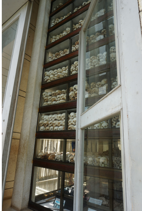
Figure 1. The inside of the memorial stupa at Choeng Ek.

Rouge were driven from Phnom Penh in January 1979, 129 mass graves were found. Eighty-six of these graves were subsequently exhumed, and the remains of nearly 9,000 individuals were disinterred. 6 In 1988, the Cambodian government built a memorial stupa (shrine) to commemorate and protect the physical remains of the Khmer Rouge victims, 7 and it is within this stupa that the human bones have stayed—virtually untouched—until recently.