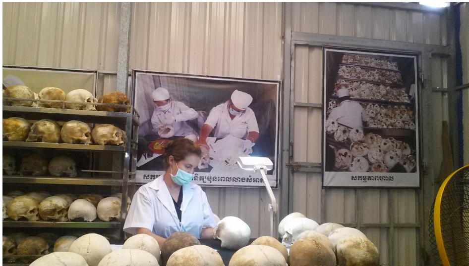
Figure 2. The author conducting research at Choeng Ek.

The author was fortunate to be able to join this team at their laboratory for the first time in 2014. She returned in late 2015 to begin anthropological doctoral research employing a biocultural (biological and socio-cultural) approach to address questions concerning the individuals executed by the Khmer Rouge regime and the agency (the effect on living individuals) of the resulting skeletal remains. The author scientifically assessed the demographics (i.e., age-at-death, sex, ancestry) and evidence of traumatic injuries (e.g., blunt force, sharp force, and gunshot trauma) of more than 500 crania at Choeng Ek.